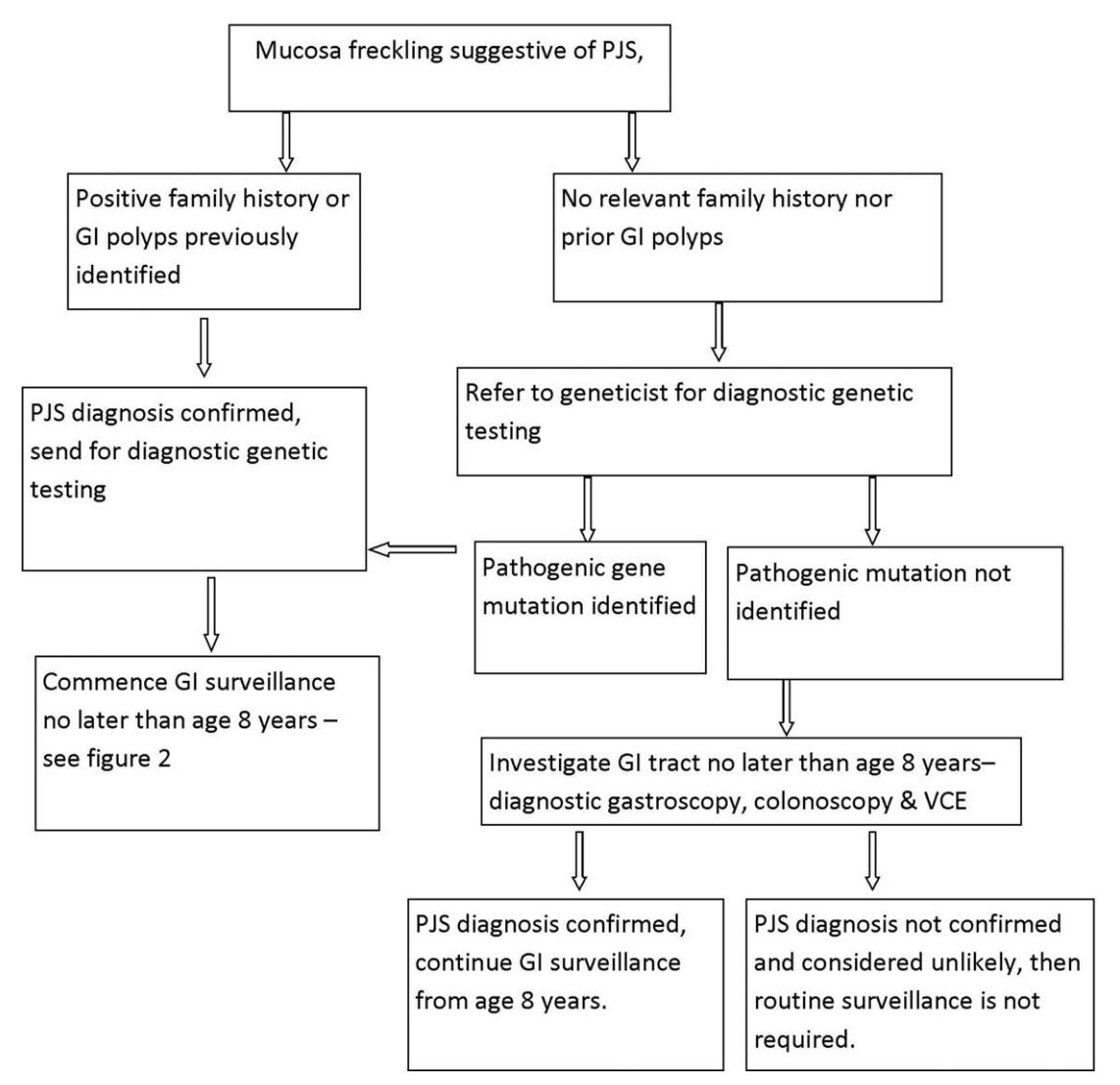
FIGURE 1. Management of a child with mucosal freckling suggestive of PJS. GI = gastrointestinal; PJS = Peutz-Jeghers syndrome; VCE = video capsule endoscopy.